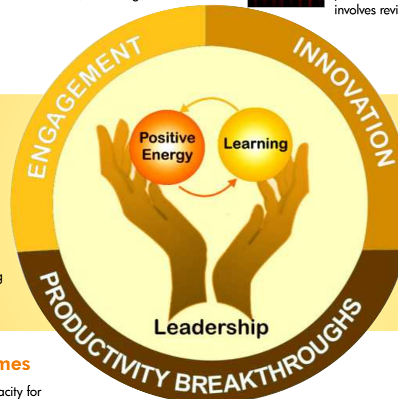
Pragati's Model for ELO™

Step 3: Expanding the Fire: The innovation process is now deepened. Detailed planning is done with I-Catalysts and Cross Functional Teams for implementation of the projects. This involves partnering with I-Catalysts and creating periodical touch points to sustain the spirit of innovation in the organization. It also involves review of the intervention at various levels.